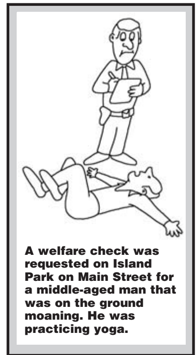
A welfare check was requested on Island Park on Main Street for a middle-aged man that was on the ground moaning. He was practicing yoga.